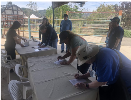
The obligatory sign-in before the tour.