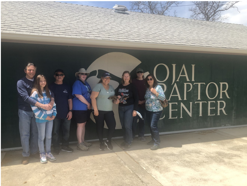
Channel Islands Divers at the entrance to the Ojai Raptor Center.