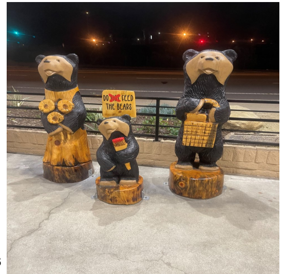
"THE BEARS" Ventura Black Bear Diner

The Ventura Black Bear Diner opened in January 2022, in the old Carrow's location. Originally, the plan was for the restaurant to occupy one-half of the building space, with medical or business offices occupying the other half of the building. Sometime in mid-2022, the Black Bear Diner corporation decided to expand the Ventura restaurant into the available space by creating two, large meeting rooms. Prior to the expansion, the Black Bear Diner had two small meeting rooms, which did not meet the club's needs. For several months our club's secretary, Rob Marion, had been evaluating new meeting spaces for Channel Islands Divers, and we wished the Black Bear Diner had a room big enough for our club meetings. As luck would have it, our new treasurer, Ann Hoagland, and friends had Thanksgiving Dinner at the Black Bear Diner, and they were seated in the new, larger meeting rooms. The search for a new meeting location was over!