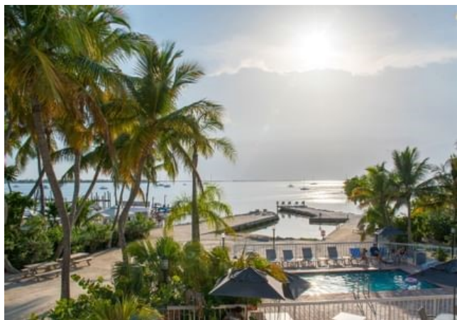
BAYSIDE INN 99490 Overseas Highway Key Largo, FL 33037 (305) 451-4450 baysidekeylargo.com

COST: Club member, non-diver - $950 per person ($248 savings) COST: Club member, diver - $1,475 per person ($1,053 savings)