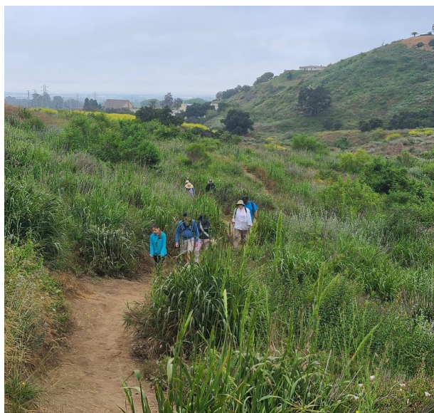
And, we're off! We took the first two side, single-track trails.