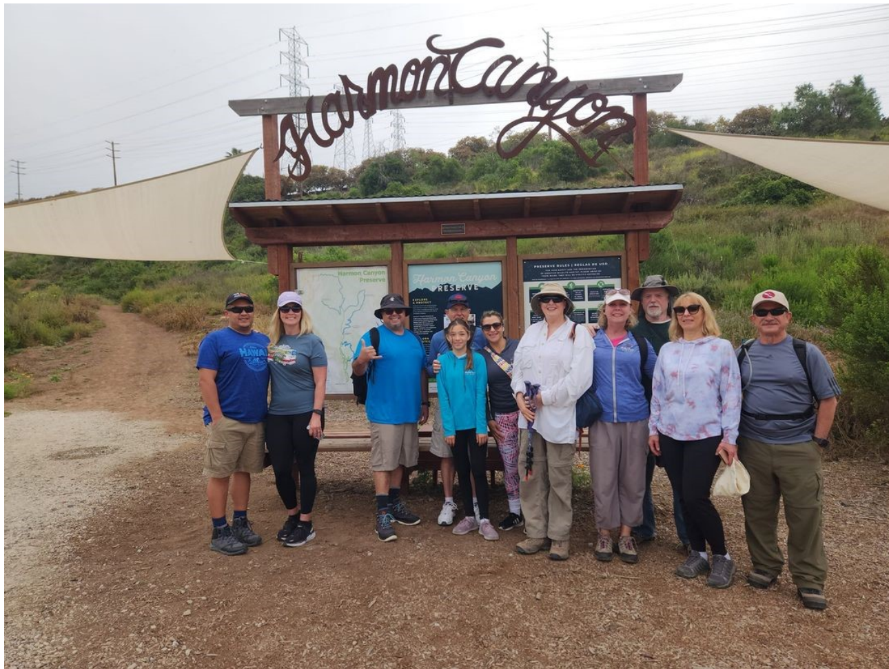
The trailhead to Harmon Canyon