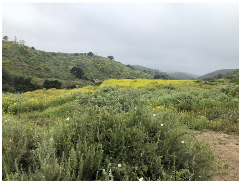
Much of the super-bloom was finished for the season, but we still had plenty of mustard, hemlock, and thistle to look at.