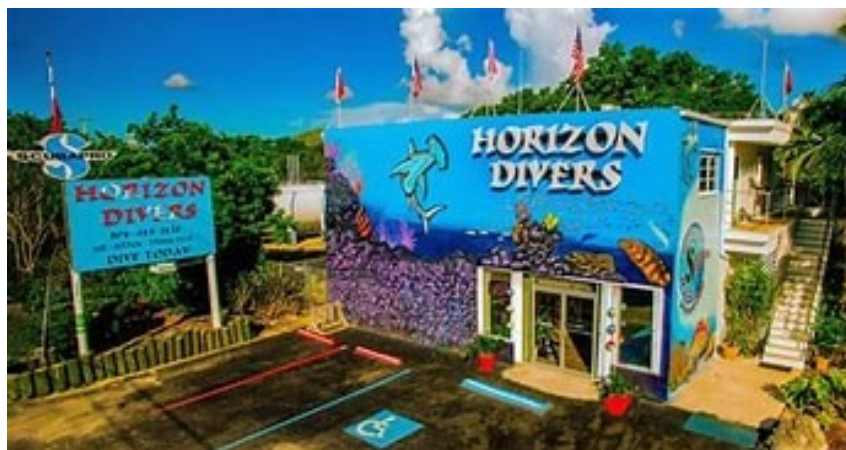
HORIZON DIVERS 105800 Overseas Highway Key Largo, FL 33037 (305) 453-3535 horizondivers.com